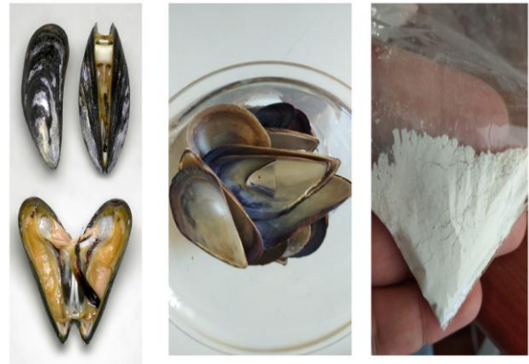
Figure 2.1. Bioceramic synthesis from mussel waste

After the mussel shell wastes were obtained from the fishermen around us, they were washed in tap water and cleaned in pure water for two hours by means of an ultrasonic bath. The oil was removed by treatment with NaOH. Calcium carbonate ( \text{CaCO}_3 ) ratio was determined by thermal gravimetric analysis (TGA) and processed with orthophosphoric acid ( \text{H}_3\text{PO}_4 ) and sintered at 850\text{ }^\circ\text{C} for 4 hours. With our patented device, our polymeric matrix composite membrane was obtained. The obtained membrane and HA bioceramic materials were turned into composite super absorbent material by hydrothermal device [2-5]. Bioceramic synthesis from mussel wastes Figure 2.1. and our product produced with our patented device is shown in Figure 2.2.